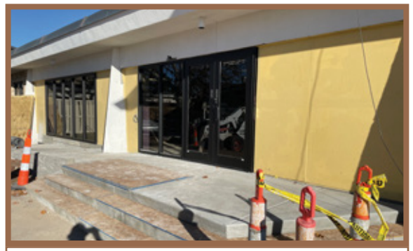
Our main office and gathering area will open up into our courtyard for even more ideal fellowship space.

Located in the old Bonnaventure Hall, our new parish office desks are being installed along our signature limestone wall.