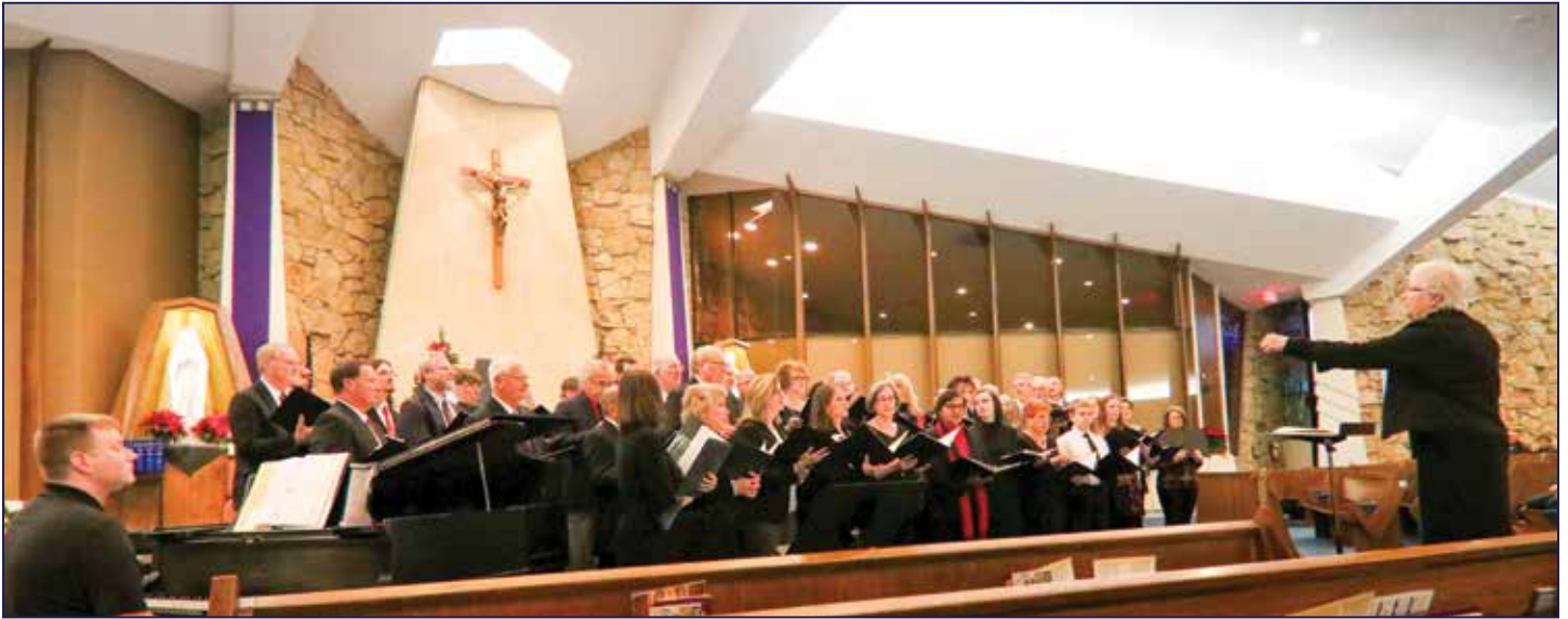
The St. Francis Music Ministry holds its annual Advent and Christmas concert on the Sunday before Christmas.